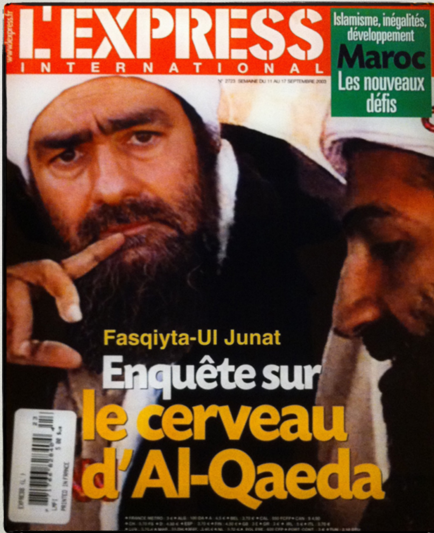
Joan FONTCUBERTA (1955), Coupure de presse en relation avec l'affaire Manbaa Mokfhi, alias Dr. Fasqiyta-Ul Junat, 2003 - série Déconstruire Oussama,