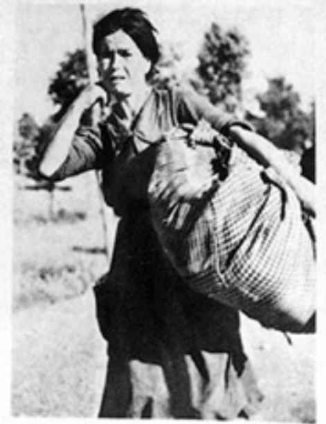
Solitaire, les larmes coulent sans bruit sur ses joues, cette guérisse emporte avec elle tout son humble bien.