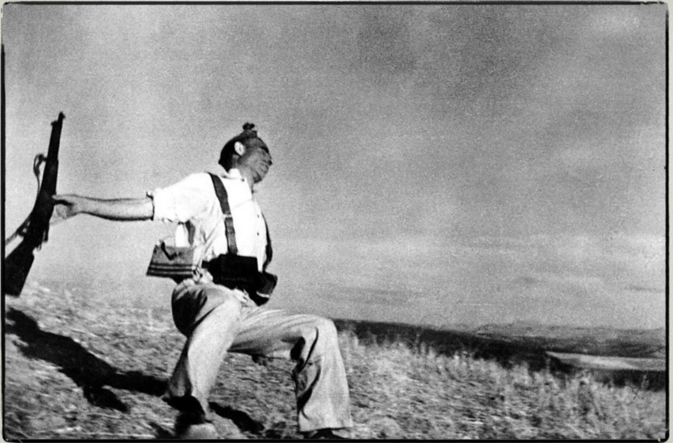
Robert CAPA, Mort d'un milicien, 1936