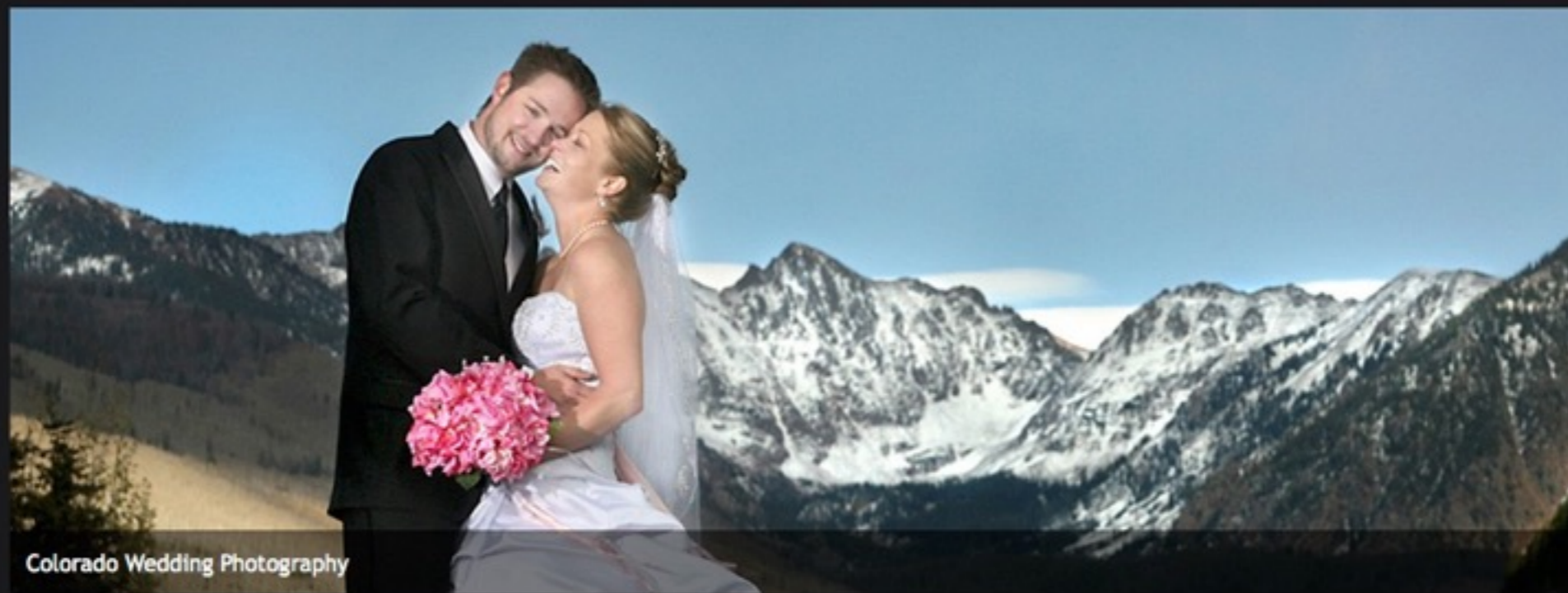
Colorado Wedding Photography