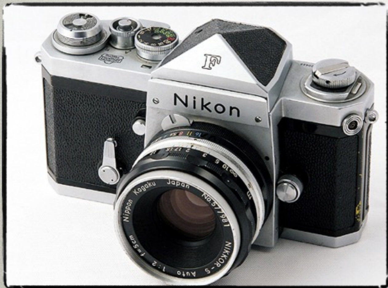
Nikon F - Appareil reflex argentique de format 24x36mm