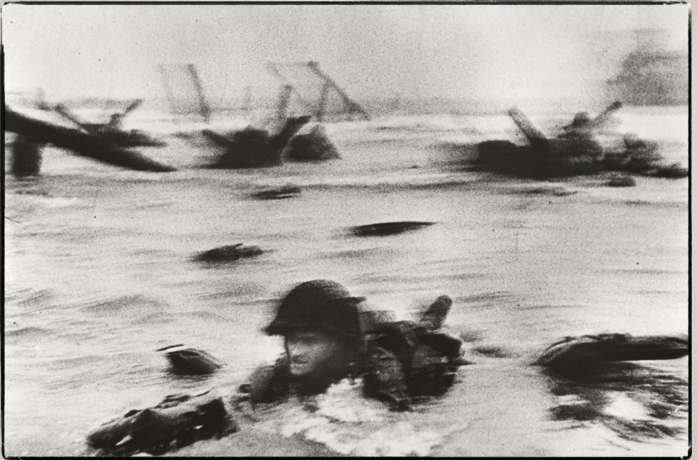
Robert CAPA, D Day, 6 juin 1944