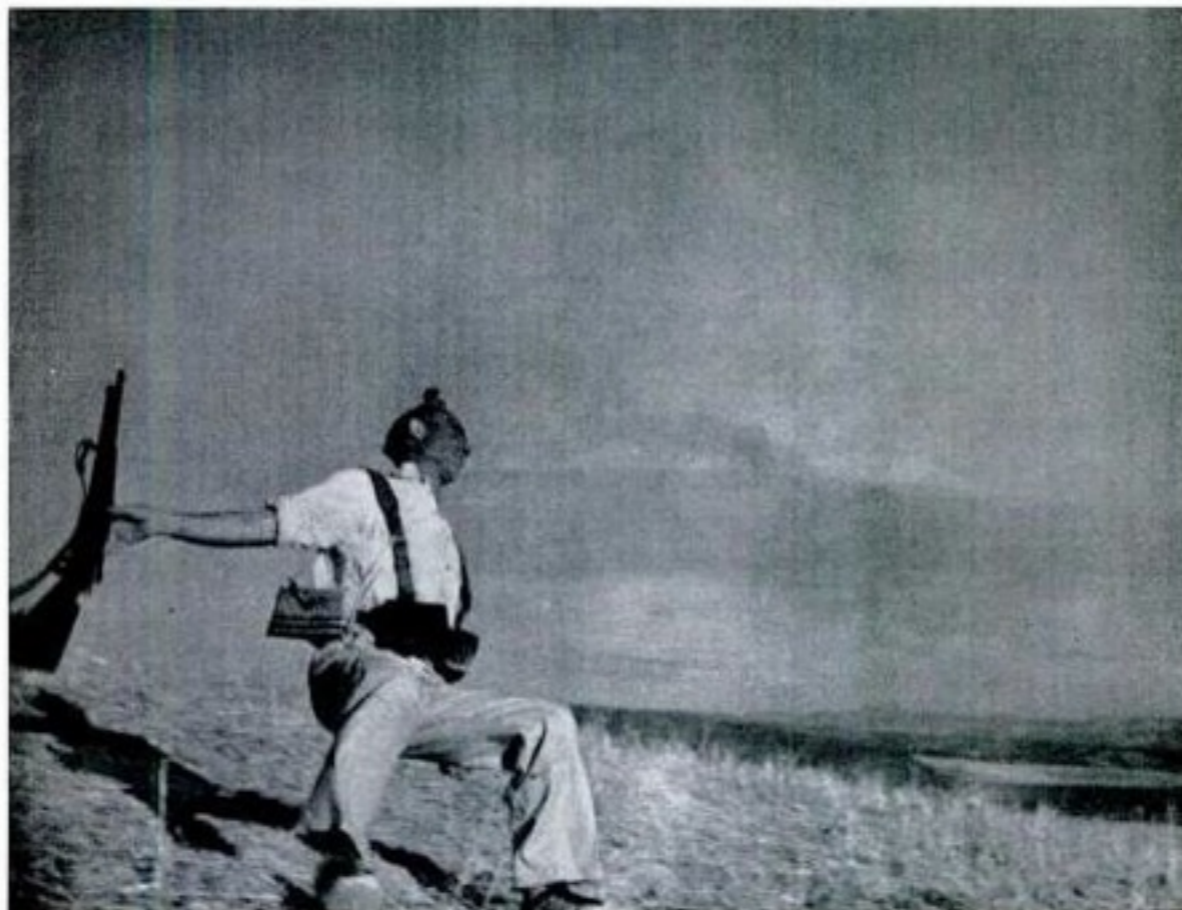
ROBERT CAPA'S CAMERA CATCHES A SPANISH SOLDIER THE INSTANT HE IS DECEIT BY A BULLET THROUGH THE HEAD IN FRONT OF CORDOBA