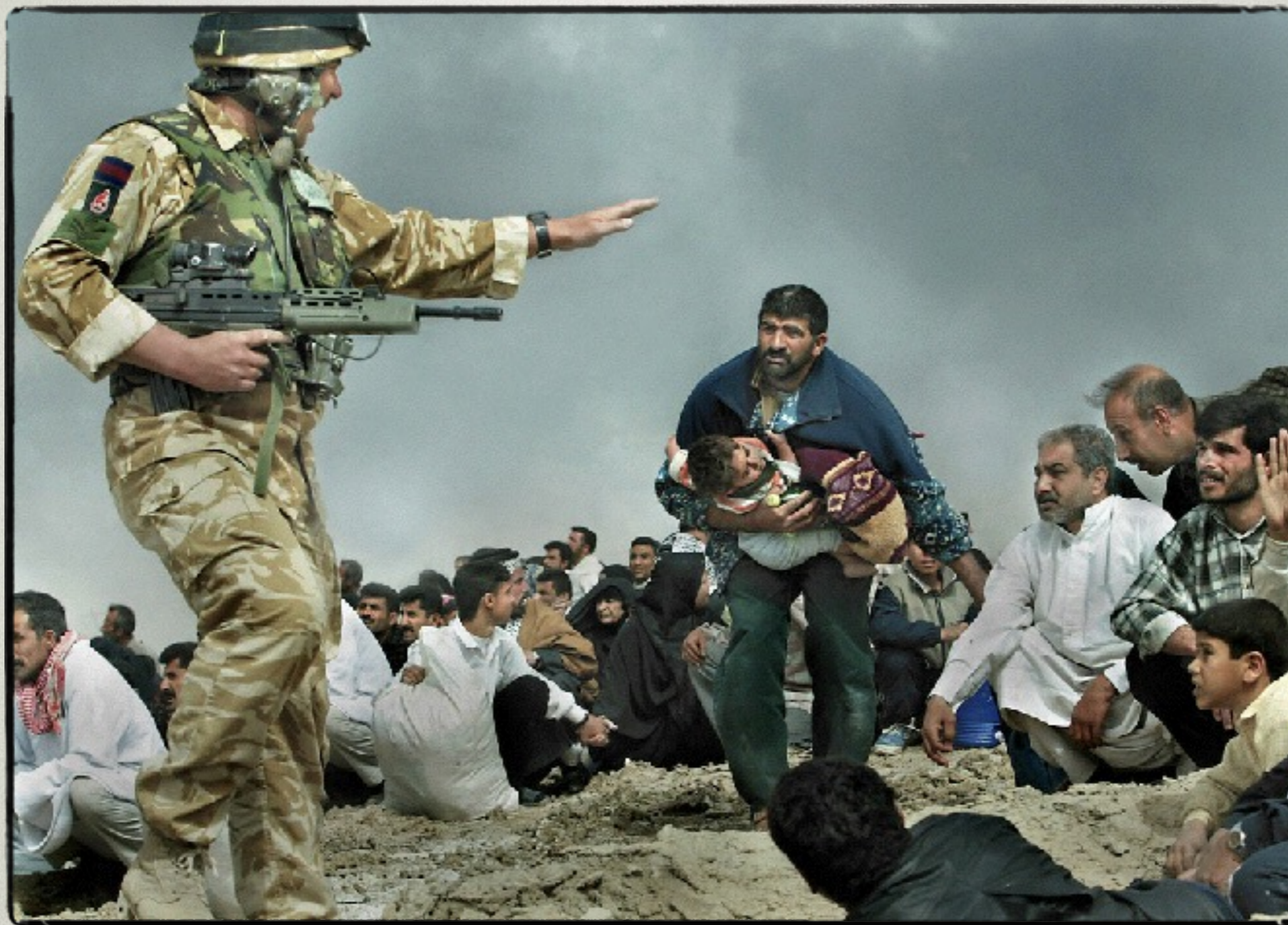
Brian WALSKI, Guerre d'Iraq, 2003