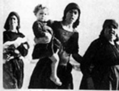
Telle une scène calquée sur la Bible, la vision de ces fuitives au visage douloureux évoque les exodes bibliques de l'Ancien Testament.