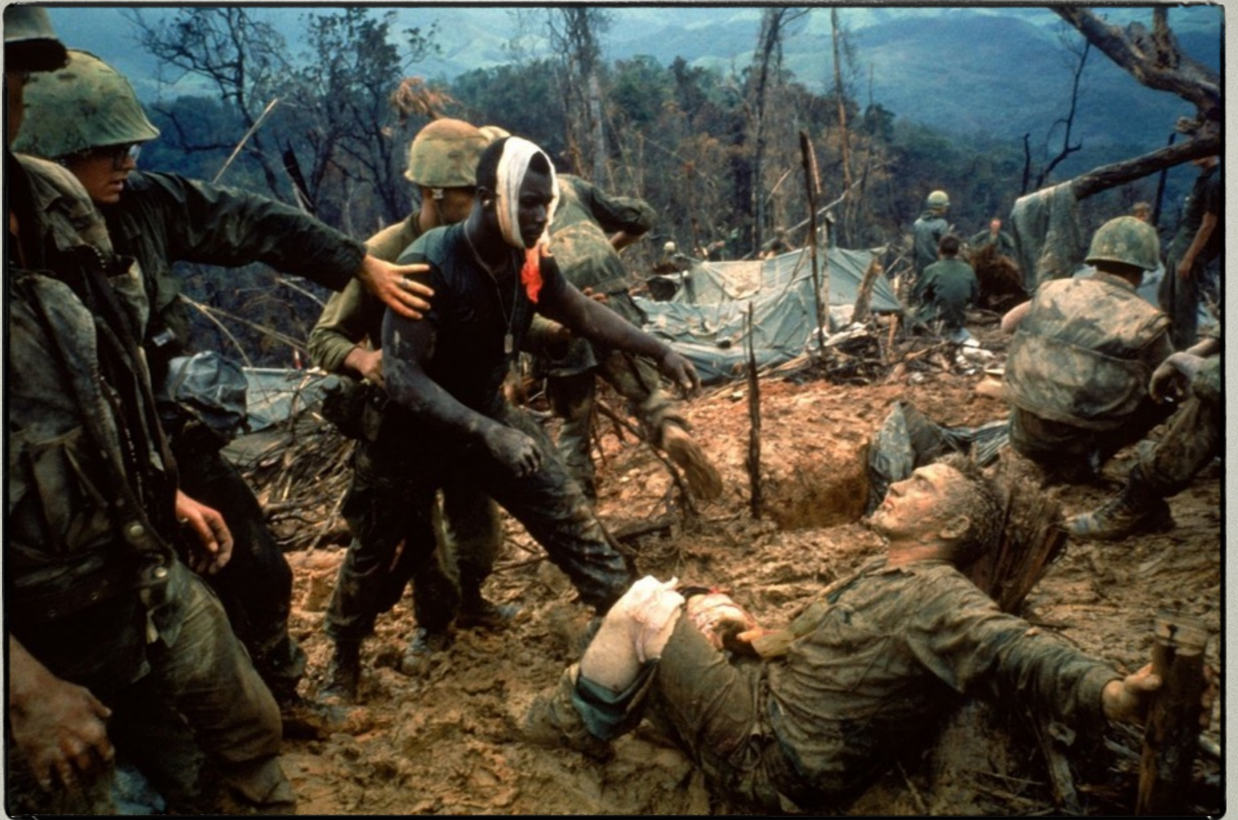
Larry BURROWS, « Reaching Out », Mutter Ridge, Nui Cay Tri, South Vietnam, 1966