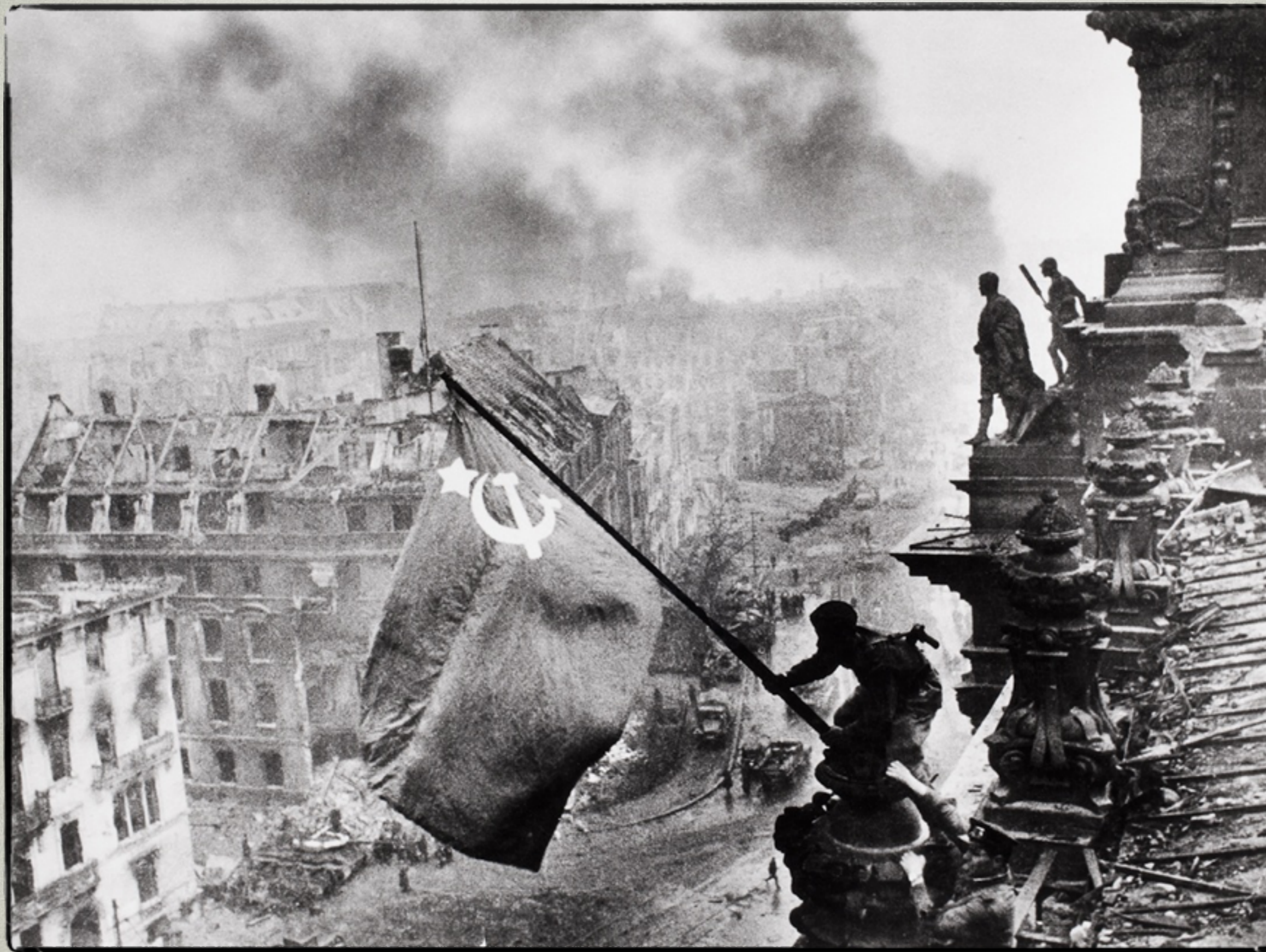
Yevguény KHALDEĭ, Berlin, 2 mai 1945