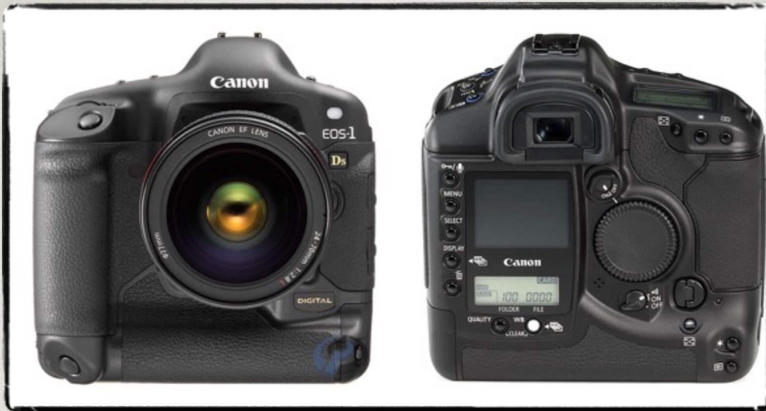
Canon Reflex numérique, EOS Ds, modèle 2003