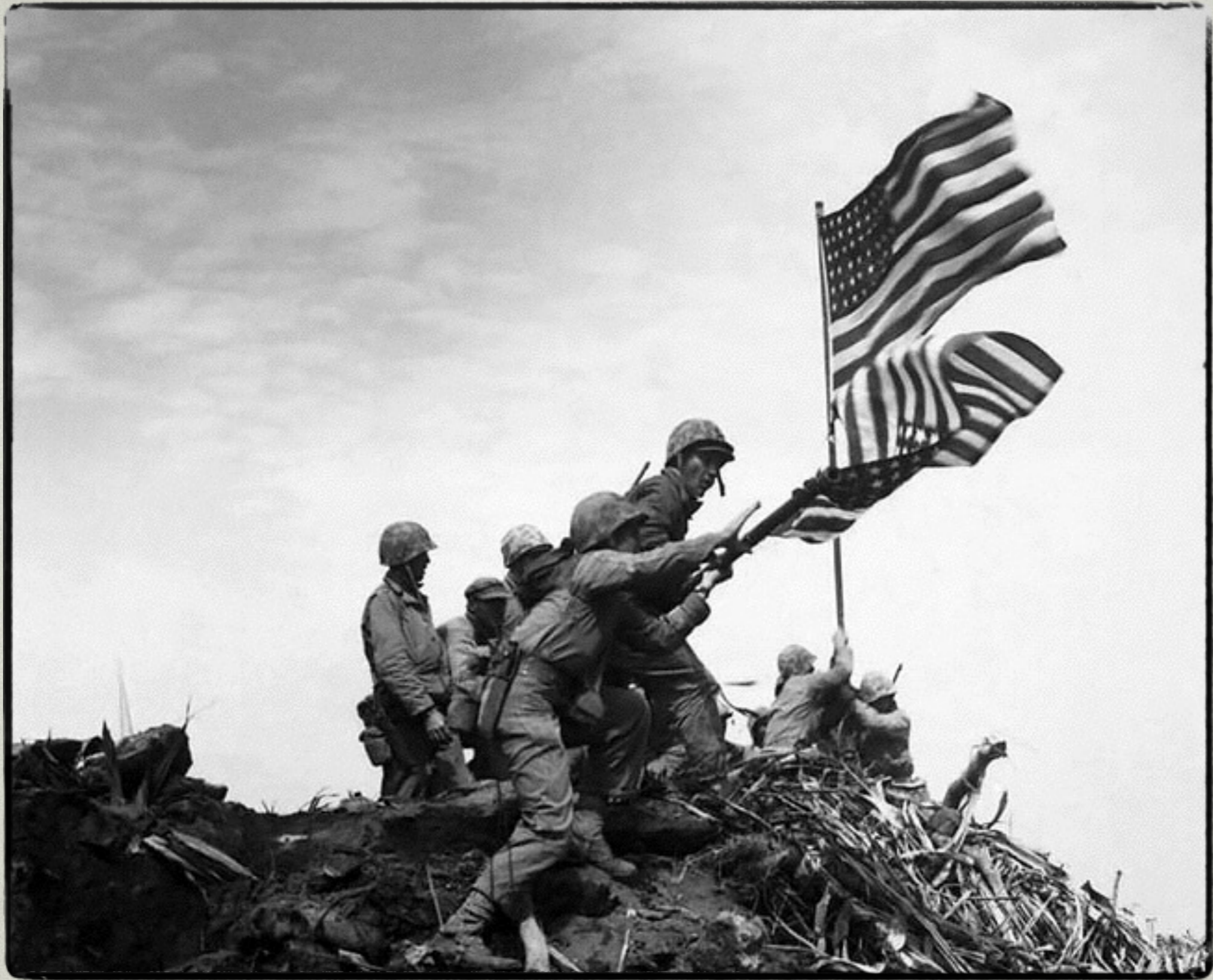
Retrait du premier drapeau et second drapeau hissé, Iwo Jima