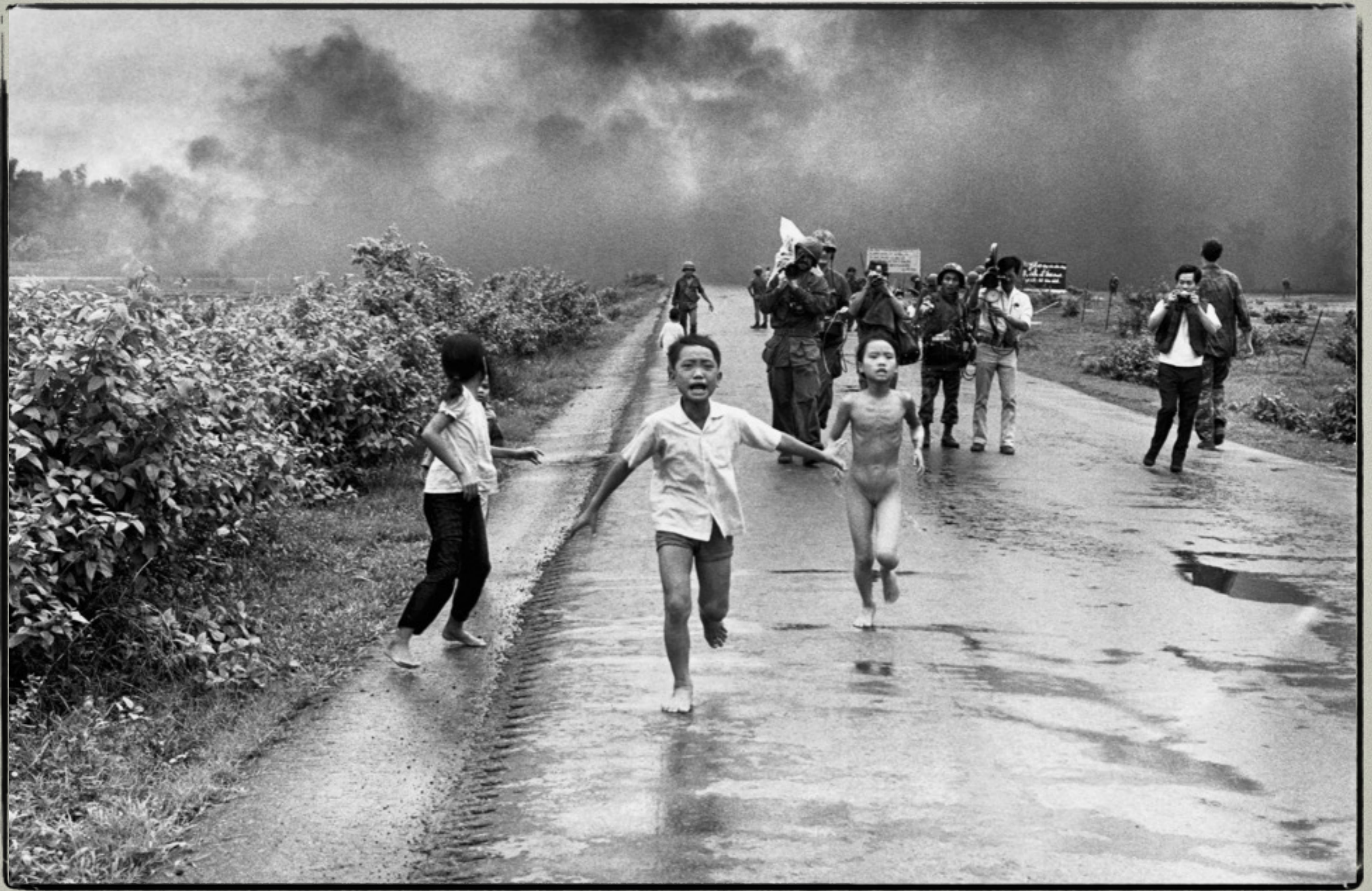
Nick UT, Vietnam, 1972, premier cliché