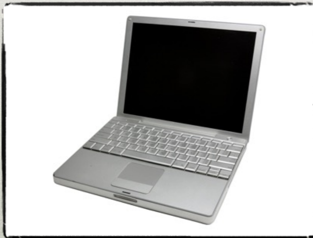
MacBook Pro, modèle 2003