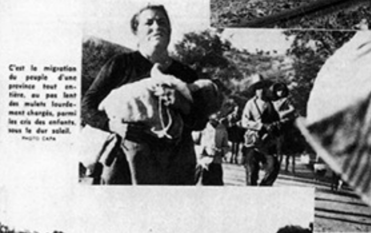
C'est la migration du peuple d'une province tout an- tière, au pas lent des mulets lourdé- ment chargés, parmi les cris des enfants, sous le dur soleil.