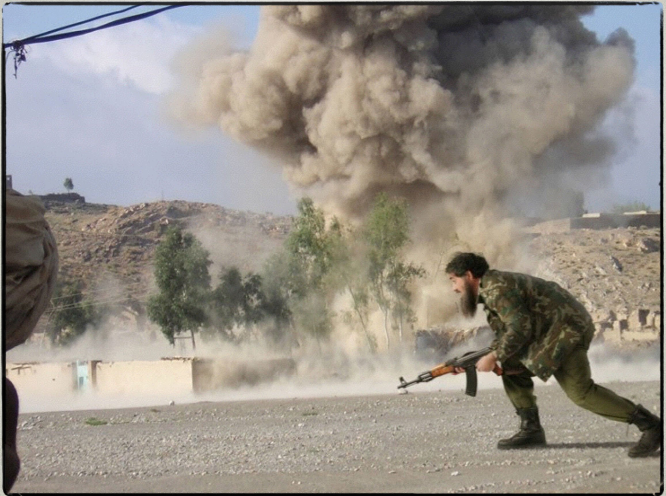
Joan FONTCUBERTA (1955), Le Dr. Fasqiyta-Ul Junat menant une incursion de la guérilla des talibans d'Al-Qaïda , Mazar-e-Sharif, 2003 , épreuve chromogénique, série Déconstruire Oussama, 2007