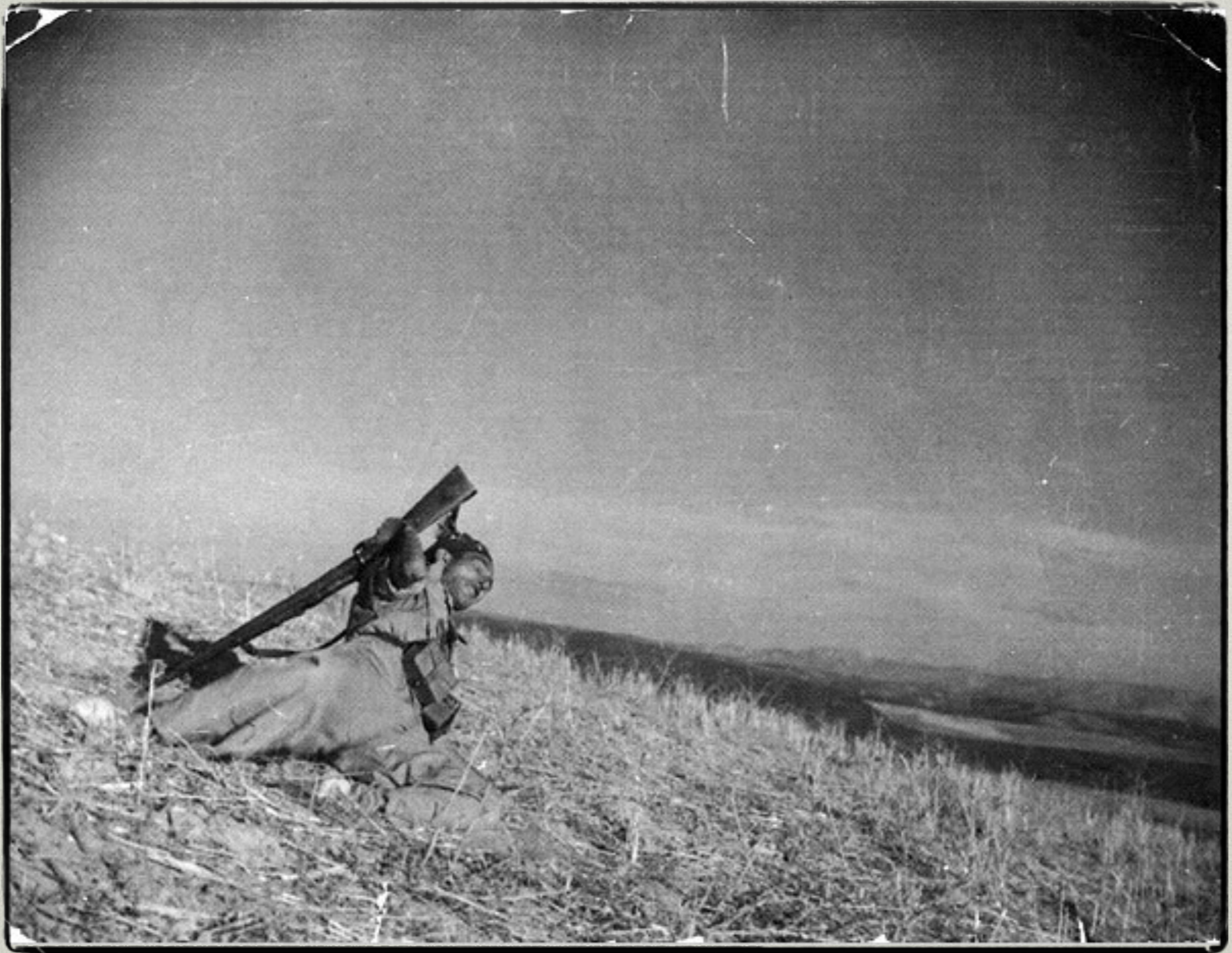
Robert CAPA, Mort d'un milicien, (second cliché) 1936