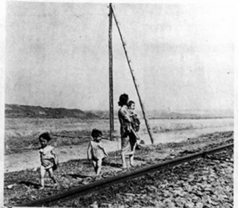
Longeant les rails infinis, les enfants, insouciés, croient à une promenade joyeuse, mais leur mère, d'un long regard, contemple une dernière fois le village embrasé.