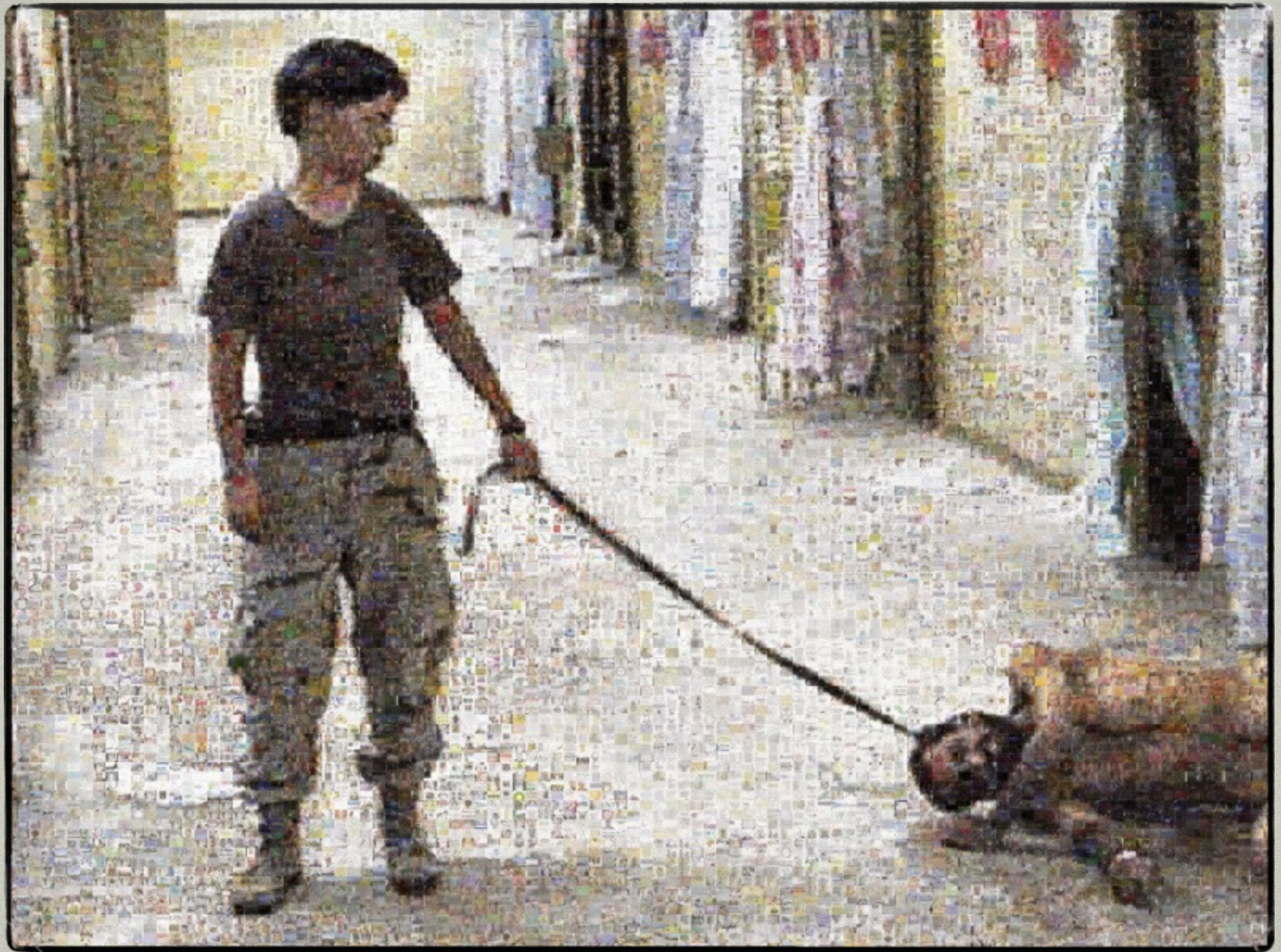
Joan FONTCUBERTA (1955), Abu Ghraib, 2004, épreuve chromogénique, 75x100 cm