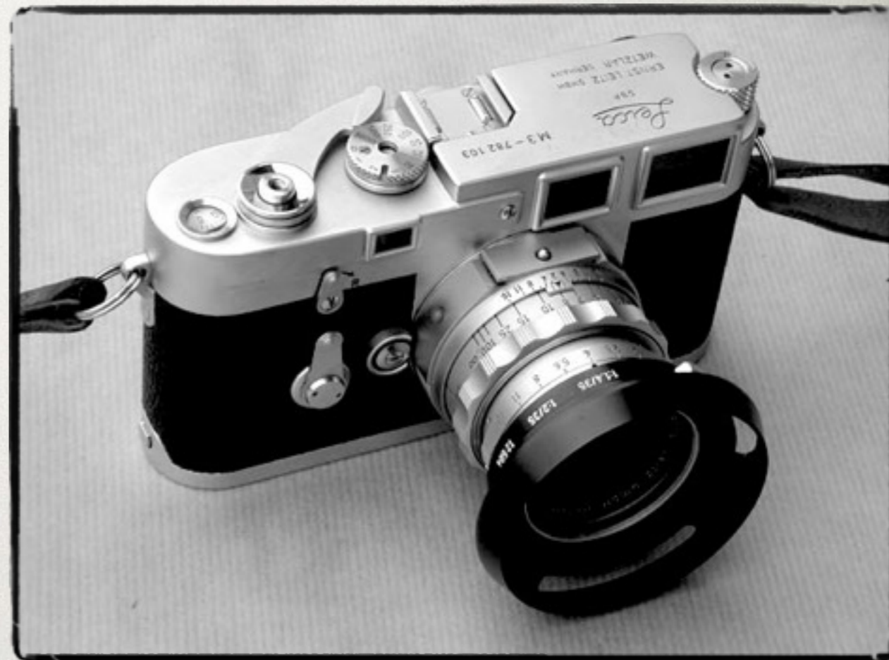
Leica M3 - Appareil télémétrique argentique de format 24x36mm