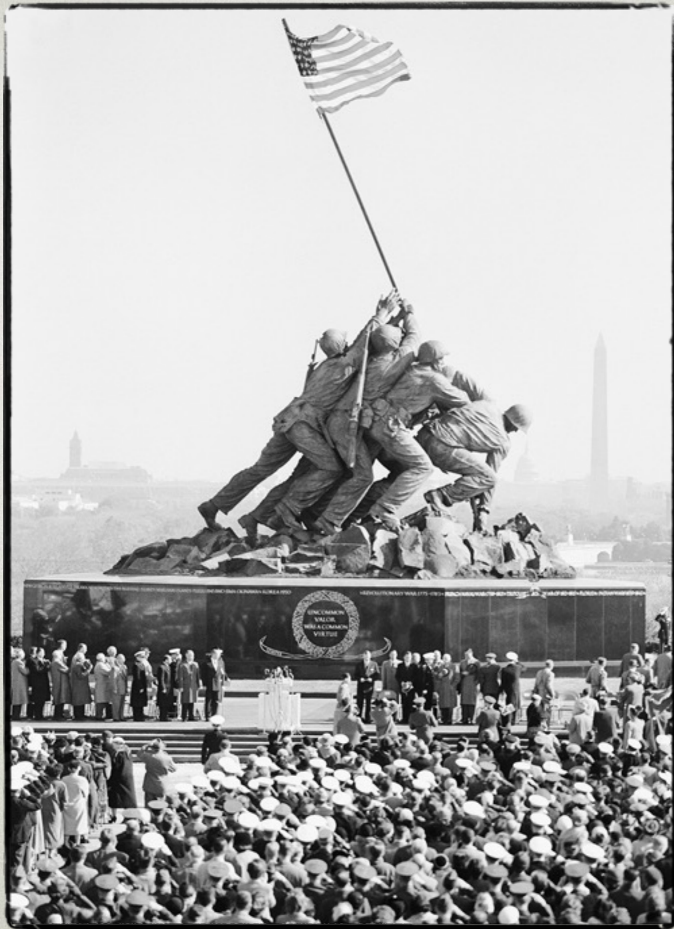
Inauguration du monument à Iwo Jima, Arlington, Washington D.C. USC Memorial, 10 novembre 1954