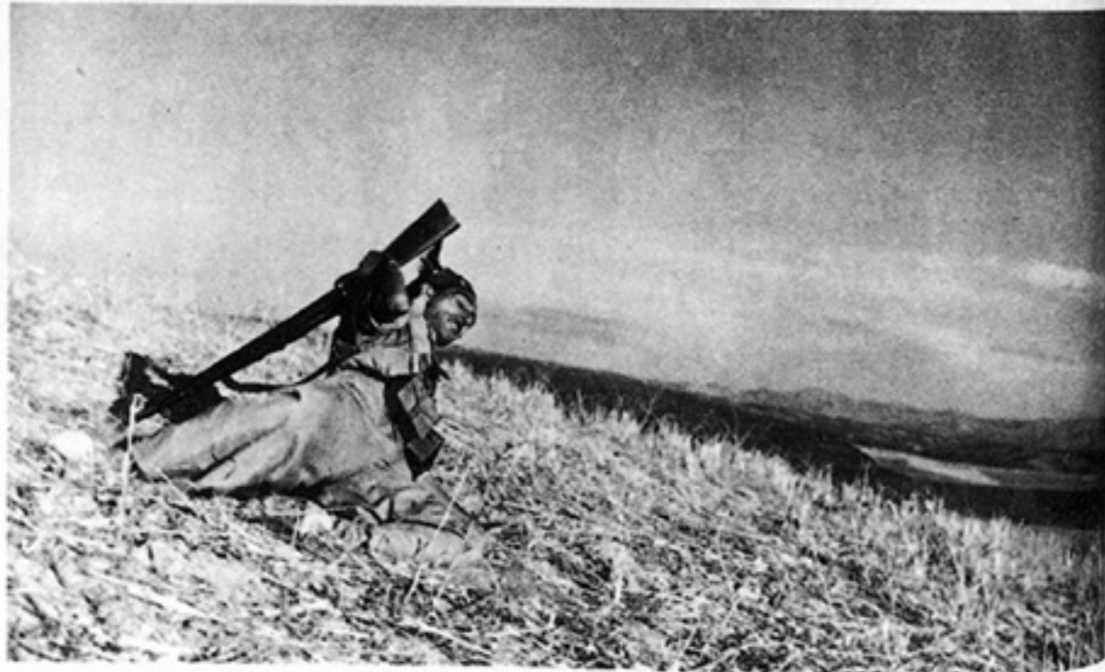
Le jeton vif, le poitrine au vent, fuil au poing, ils dévalaient la pente couverte d'un chevre raide... Soudain l'essor est brisé, une balle a sifflé — une balle fratricide — et leur sang est bu par la terre natale...