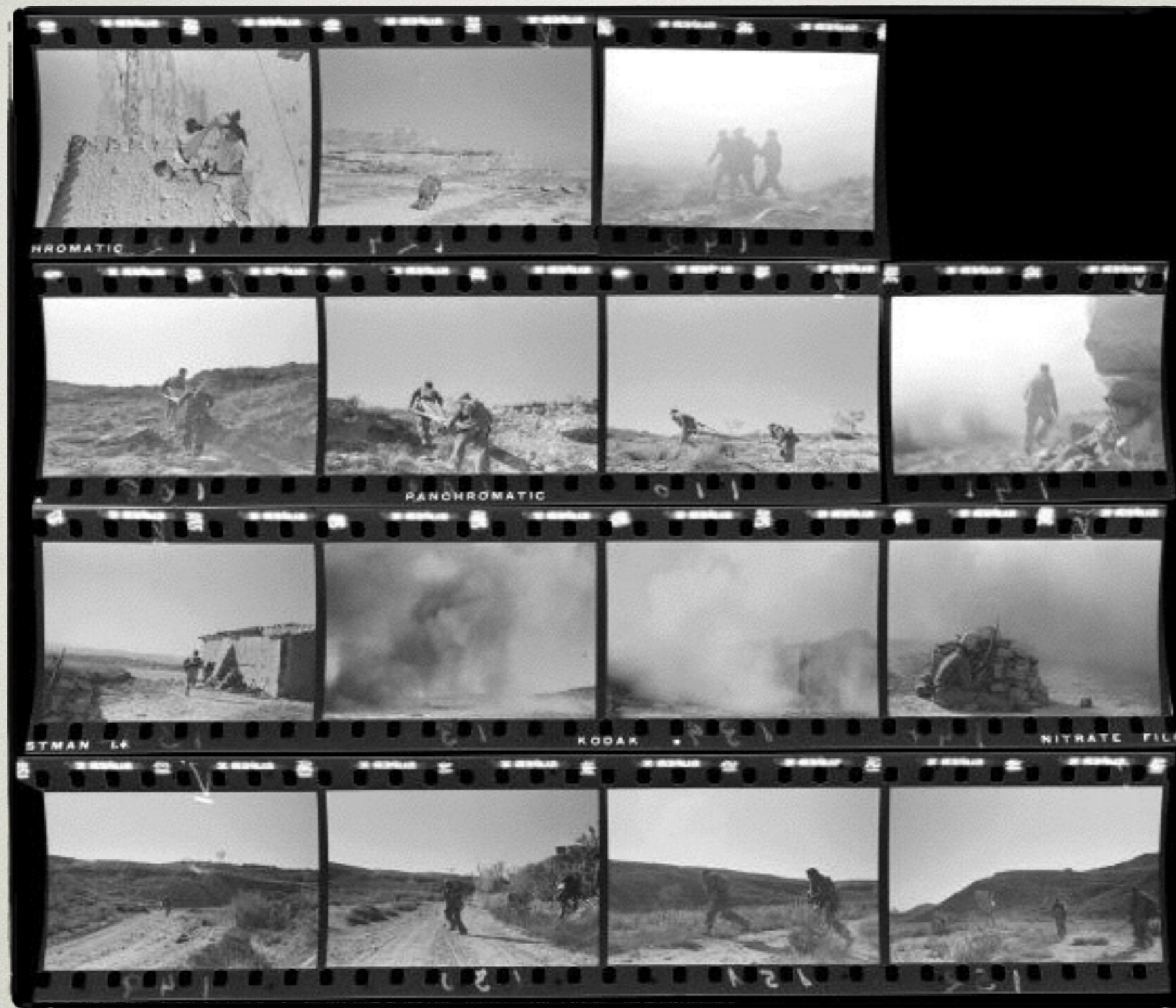
Robert CAPA, planche contact