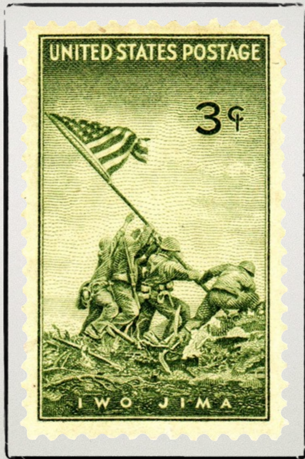
Timbre Iwo Jima, 11 juillet 1945 (137 millions d'exemplaires)