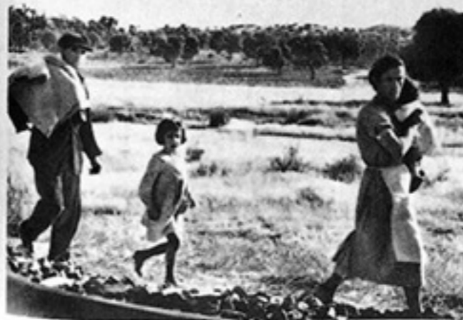
Peut-être vivaient-ils heureux, peut-être souffraient-ils des jours penibles dans un calme village... La guerre civile est venue et avec elle le désespoir, l'écroulement d'un foyer dans la misère.