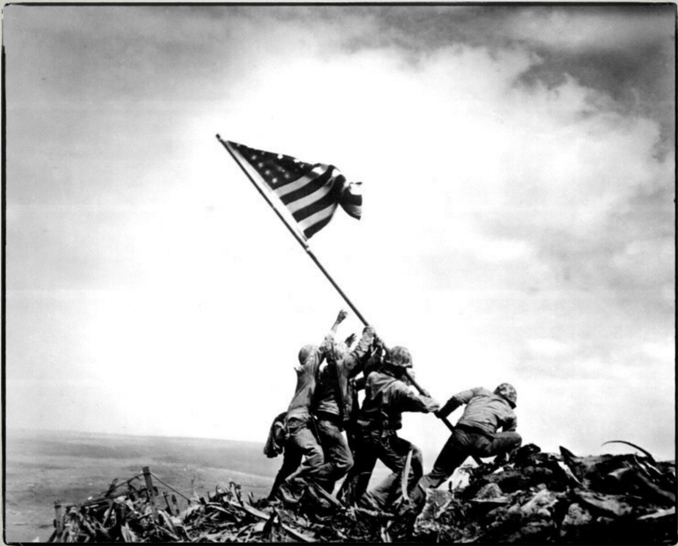
« Raising the Flag on Iwo Jima », Joe Rosenthal, 1945