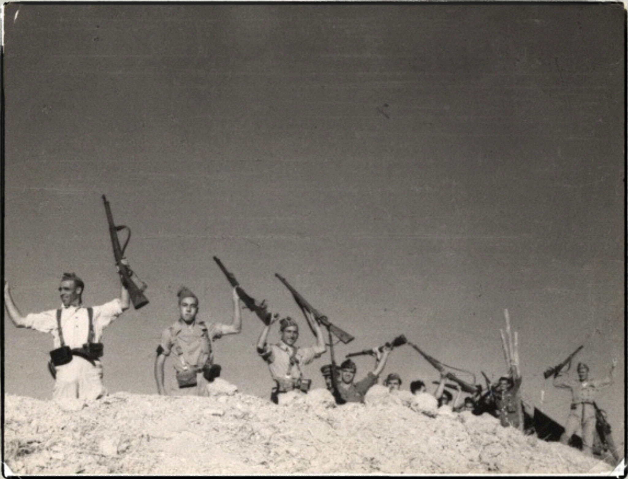
Robert CAPA, Portrait de miliciens, 1936